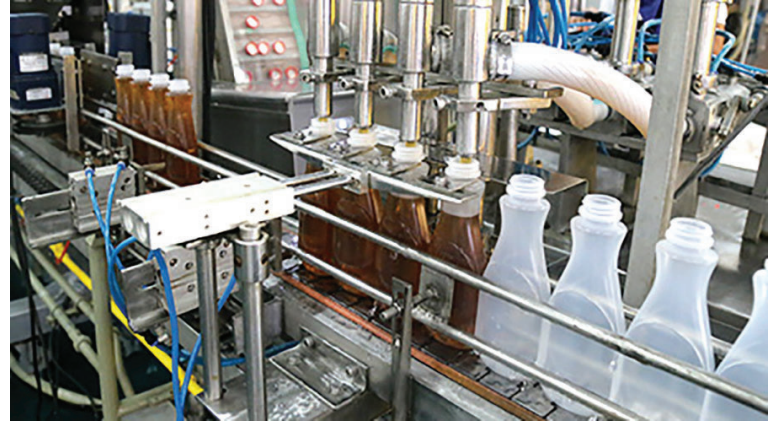
SYSU Distribution Center