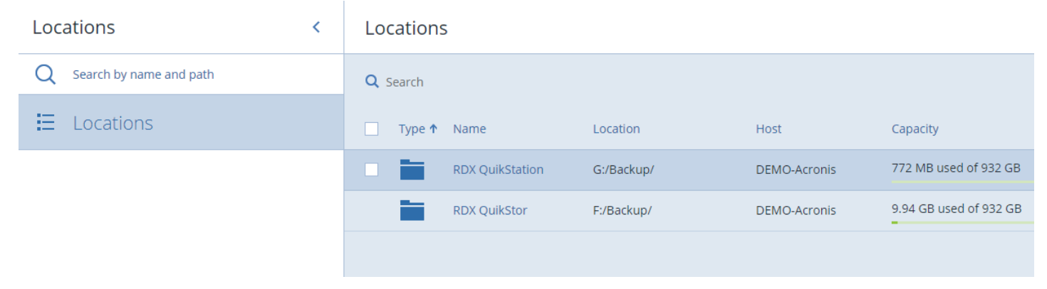
Integration of RDX QuikStor and RDX QuikStation as a backup location for Acronis Cyber Backup

RDX removable disk systems and media are fully compatible with Acronis Cyber Backup. The RDX appears as a regular drive letter and can be easily added as a new backup location during the initial setup of Acronis Cyber Backup. This enables RDX to be used as a backup target for backup plans.