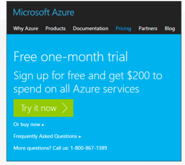
Setup Microsoft Azure Account