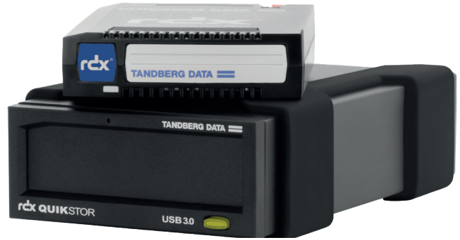
RDX QuikStor is the solution for backup, archiving and data exchange in harsh environments.

The USB port powered RDX QuikStor is a media based removable disk solution. The media is built with a rugged design and requires no special care. It can withstand drops from up to 1 meter on a concrete floor. The cartridge has a sealed interface so dirt and debris can't get inside, and it provides static-proof capabilities. Up to 5000 insertion/removal cycles ensure reliable daily use. An archival lifetime up to 10 years and optional WORM functionalities makes it best for archiving applications. The RDX QuikStor system with media capacities from 500GB to 5TB, is an affordable system with a low total cost of ownership.