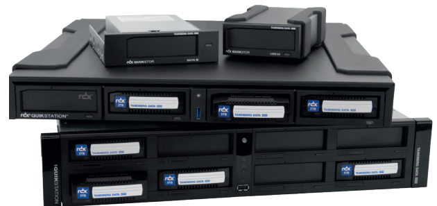
RDX product family offer ideal solutions for backup, archiving and data exchange for pharmacies and drug stores

* optional features, separate software license required