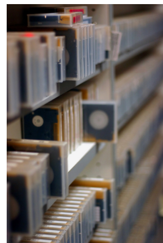
Examination results and student data must be kept for several years even after graduation. RDX QuikStor offers an archival life of 10 years with no compatibility issues.