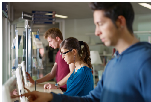
RDX QuikStor is for easy backup of important student data like examination results, grades, certificates and even teacher related data.