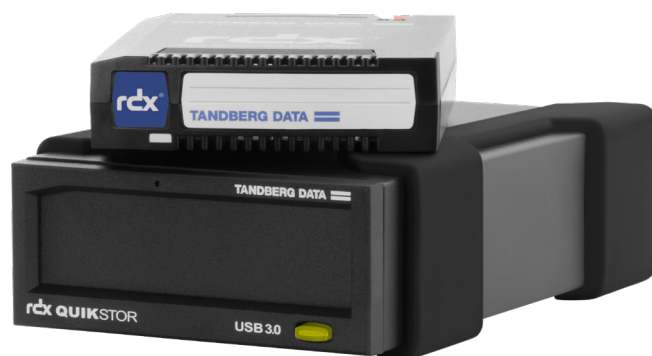
RDX QuikStor is the solution for backup, archiving and data exchange at educational institutes.

In addition, student data needs to be archived many years after graduation. This causes constant data growth and requires more and more cost intensive disk space. To avoid this, data should be archived to a removable storage media. Archiving frees up valuable disk space and reduces the amount of data which needs to be managed at once. So, as a best practice, student data should be archived immediately after they graduate or leave the institution.