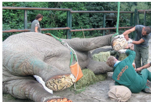
The rugged design makes RDX QuikStor tough enough for daily use in harsh environments and outdoor usage to exchange data between ambulances and hospitals.