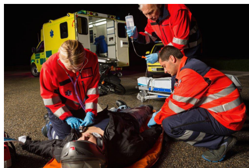
The rugged design makes RDX QuikStor tough enough for daily use in harsh environments and outdoor usage to exchange data between ambulances and hospitals.