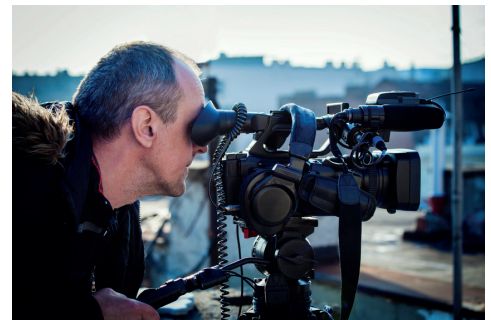
Video sequences of an outdoor set need to be transported to the studio for editing and mastering. RDX QuikStor is ideal for data transportation as its rugged design withstands outdoor challenges.