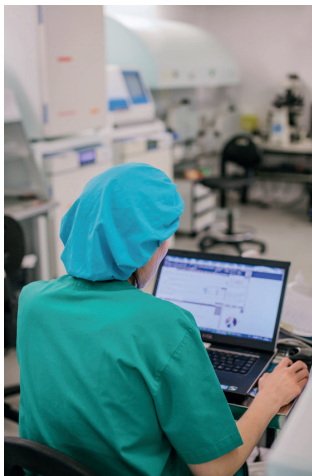
RDX QuikStor is ideal for secure long-term archiving of medical data including x-rays or ultrasonic pictures.