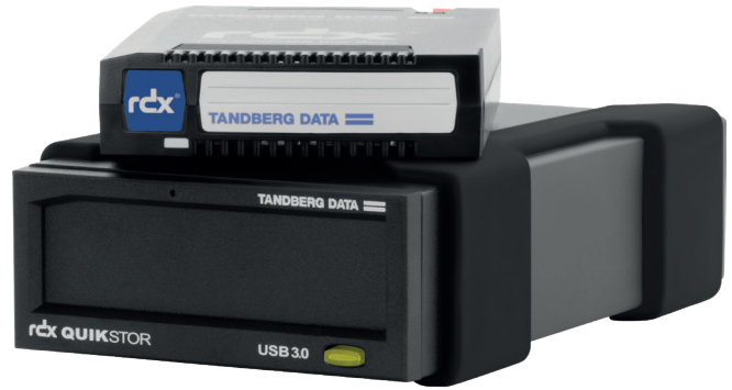
RDX QuikStor is the solution for backup, archiving and data exchange in harsh environments.

The USB port powered RDX QuikStor is a media based removable disk solution. The media is built with a rugged design and requires no special care. It can withstand drops from up to 1 meter on a concrete floor. The cartridge has a sealed interface so dirt and debris can't get inside, and it provides static-proof capabilities. Up to 5000 insertion/removal cycles ensure reliable daily use. An archival lifetime up to 10 years and optional WORM functionalities makes it best for archiving applications. The RDX QuikStor system with media capacities from 500GB to 5TB, is an affordable system with a low total cost of ownership.