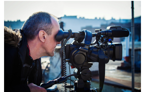
Video sequences of an outdoor set need to be transported to the studio for editing and mastering. RDX QuikStor is ideal for data transportation as its rugged design withstands outdoor challenges.