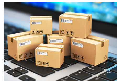
Transportation and logistics businesses are dependent on data availability. Data loss would stop the whole logistics process. Frequent backups on RDX QuikStor will counteract such a disaster and provide data availability.

Sales and support for Overland-Tandberg products and solutions are available in over 90 countries. Contact us today at sales@overlandtandberg.com