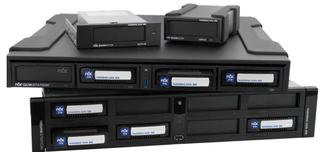
RDX product family offer ideal solutions for backup, archiving and data exchange for pharmacies and drug stores

* optional features, separate software license required