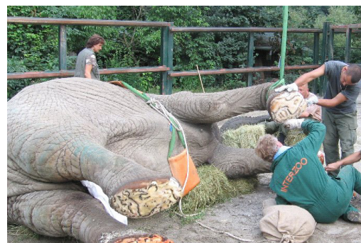
The rugged design makes RDX QuikStor tough enough for daily use in harsh environments and outdoor usage to exchange data between ambulances and hospitals.