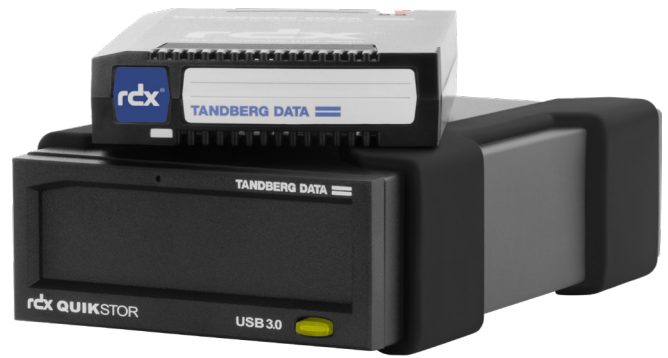
RDX QuikStor is the solution for backup, archiving and data exchange in harsh environments.

The USB port powered RDX QuikStor appliance is a removable disk solution that consists of a QuikStor system and a RDX media. The media is built with a rugged design and requires no special care. It can withstand drops from up to 1 meter on a concrete floor. The cartridge has a sealed interface so dirt and debris can't get inside, and it provides static-proof capabilities. Up to 5000 insertion/removal cycles ensure reliable daily use. An archival lifetime up to 10 years and optional WORM functionalities makes it best for archiving applications. The RDX QuikStor appliance with cartridge capacities from 500GB to 5TB, is an affordable system with a low total cost of ownership.