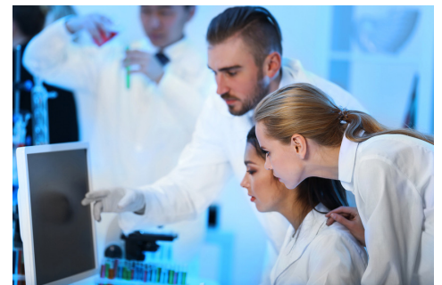
Examination results and laboratory findings must be kept for several years. RDX QuikStor offers an archival life of 10 years with no compatibility issues.