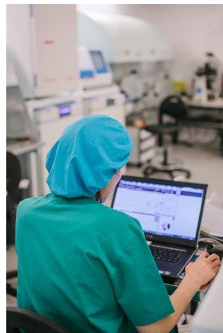
RDX QuikStor is ideal for secure long-term archiving of medical data including x-rays or ultrasonic pictures.