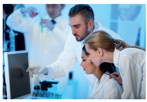
Examination results and laboratory findings must be kept for several years. RDX QuikStor offers an archival life of 10 years with no compatibility issues