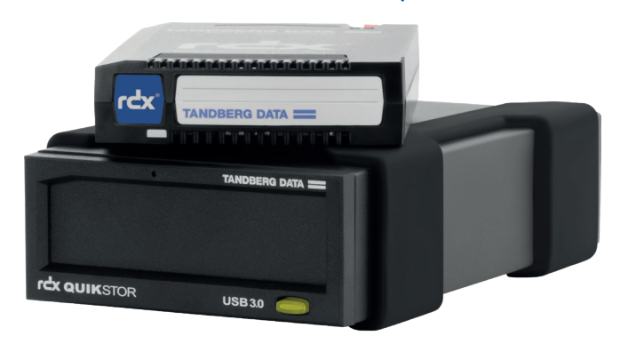
RDX QuikStor is the solution for backup, archiving and data exchange in harsh environments.

The USB port powered RDX QuikStor appliance is a removable disk solution that consists of a QuikStor system and a RDX media. The media is built with a rugged design and requires no special care. It can withstand drops from up to 1 meter on a concrete floor. The cartridge has a sealed interface so dirt and debris can't get inside, and it provides static-proof capabilities. Up to 5000 insertion/removal cycles ensure reliable daily use. An archival lifetime up to 10 years and optional WORM functionalities makes it best for archiving applications. The RDX QuikStor appliance with cartridge capacities from 500GB to 5TB, is an affordable system with a low total cost of ownership.