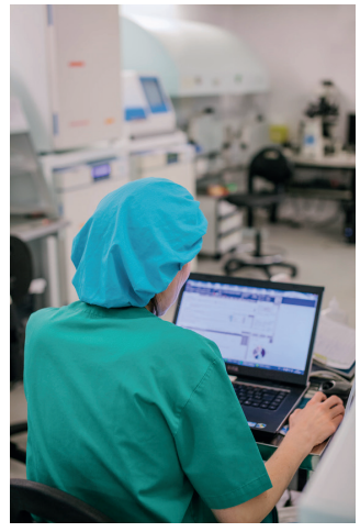
RDX QuikStor is ideal for secure long-term archiving of medical data including x-rays or ultrasonic pictures.